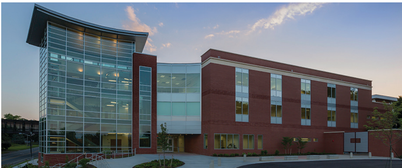
The Center for Science and Health Professions on the campus of Virginia Western Community College in Roanoke, Virginia.